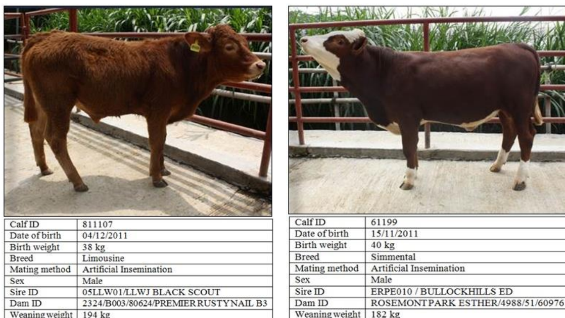
Figure 3. The best Limousine and Simmental candidate bulls at BET Cipelang based on preweaning growth curve of body weight